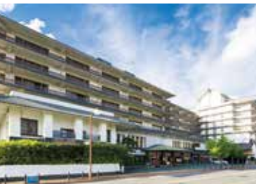
Yuda Onsen, Yamaguchi Prefecture Government Registered International Tourist Hotel No.1701

One of Japan's three great pagodas, "National Treasure Rurikoji Five-storied Pagoda" Historic site and natural monument built approximately 500 years ago There are also tourist spots such as "Joeiji Sesshu Garden" . There is also "Yuda Onsen" , which has a history of about 600 years. "Yamaguchi Gion Festival" was also introduced.