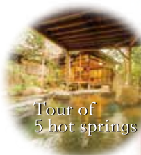
Tour of 5 hot springs

4-6-4 Yuda Onsen, Yamaguchi City, Yamaguchi Prefecture 〒753-0056 TEL : +81-83-922-0091 FAX : +81-83-924-3080 URL https://www.n-tokiwa.co.jp