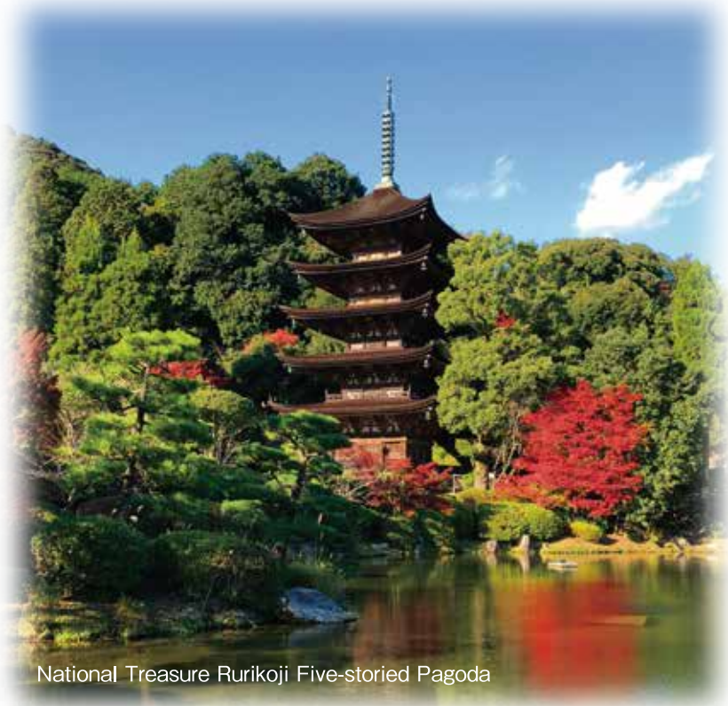
National Treasure Rurikoji Five-storied Pagoda

Rurikoji Temple's five-storied pagoda is undergoing complete re-thatching of its cypress bark roof for the first time in about 70 years (scheduled to finish in March 2026)