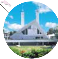
Xavier Memorial Cathedral (10minutes)