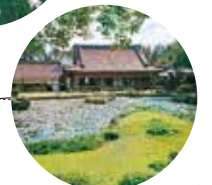
Joeiji Temple Sesshu Garden (15minutes)